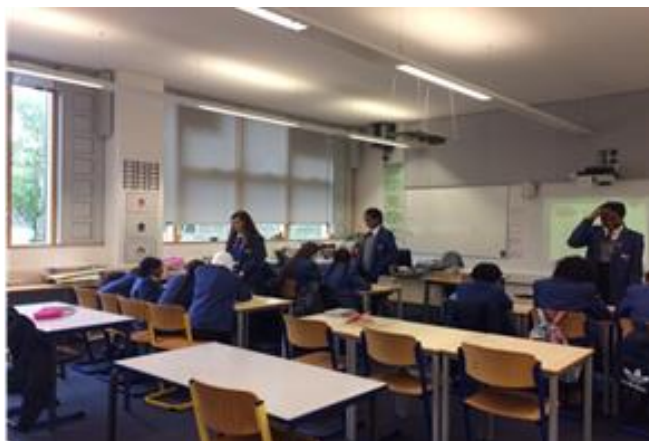
Pictured are pupils during Anti-Bullying training.