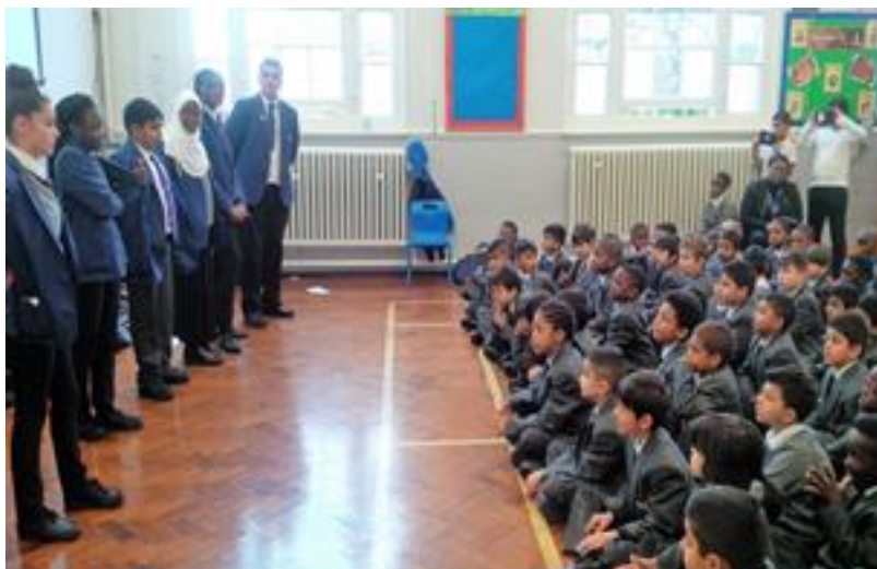
Anti-Bullying Ambassadors giving an assembly at Winterbourne Primary School.