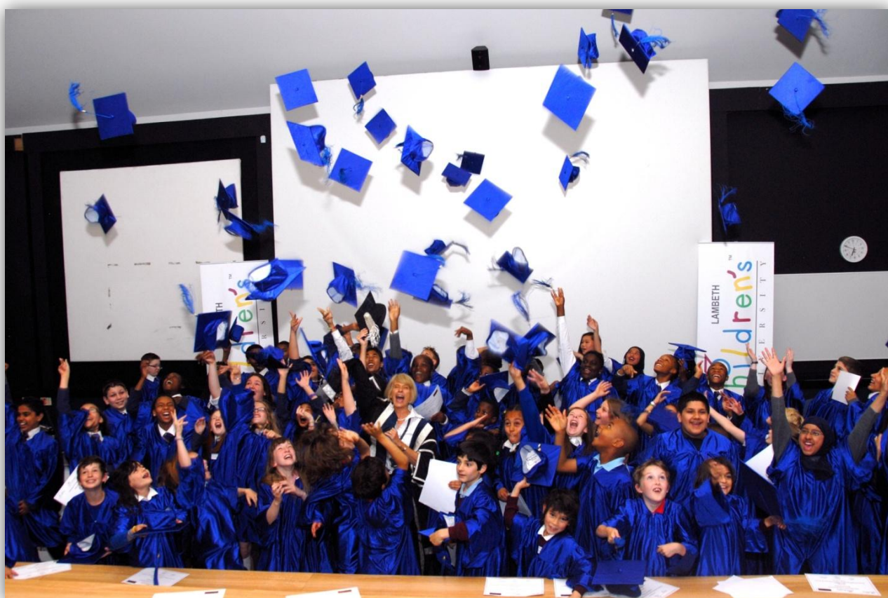
Stockwell Park High School pupils graduating from the Children's University

The school would like to congratulate all its pupils!