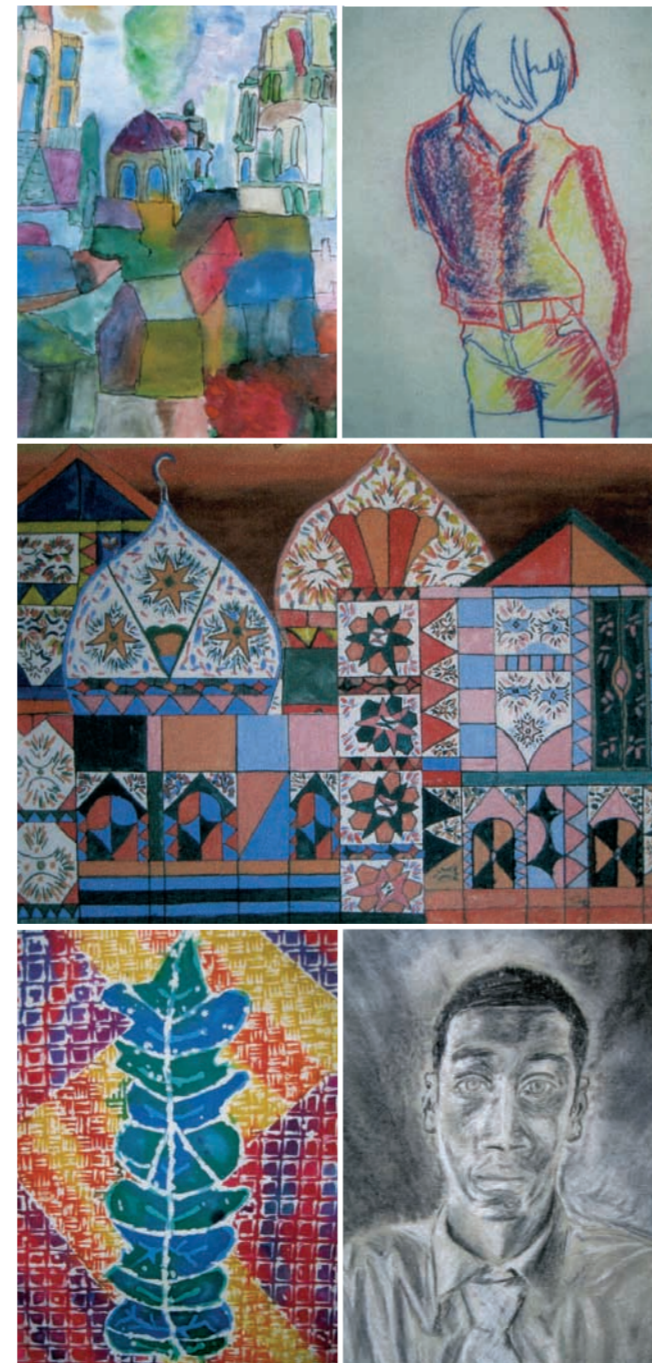
Prepared and produced by First Service Marketing (01883) 714246