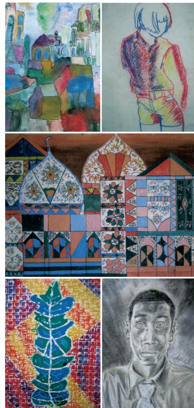
Prepared and produced by First Service Marketing (01883) 714246